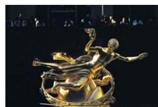
Customized Gamma Control